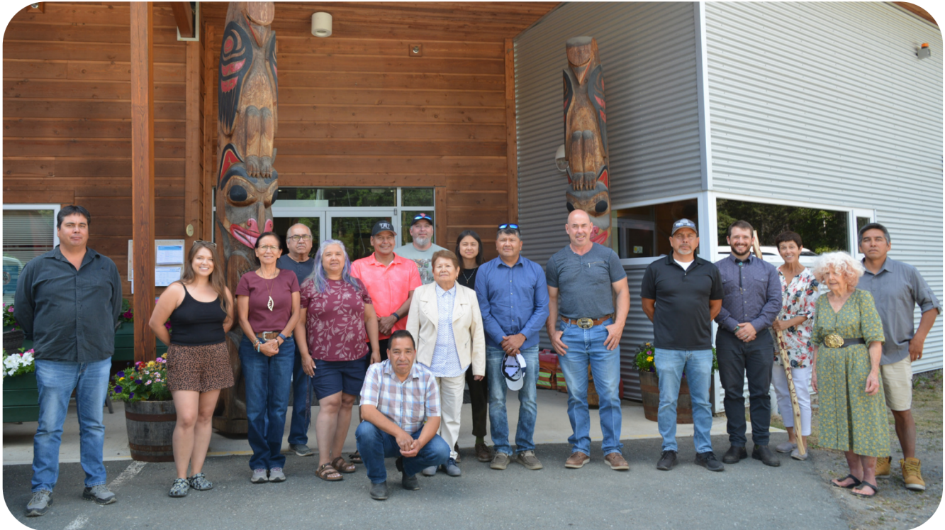
Pictured above is NNTC members and Upper Skagit representatives

Nlaka'pamux Nation Tribal Council (NNTC)'s quarterly news, announcements, and cultural and historical pieces