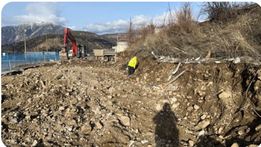
Village of Lytton Surface inspection—inspecting cutbank (Spring 2023)