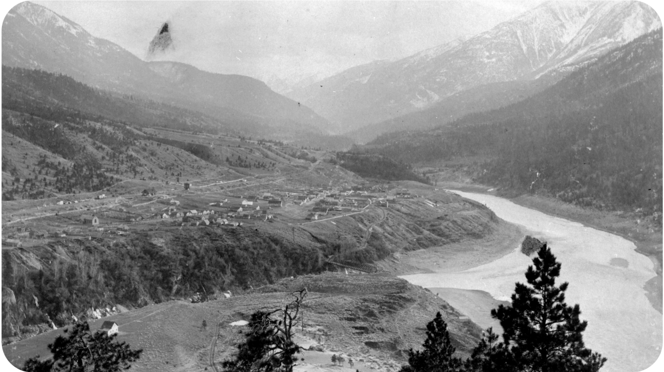
Pictured above is Lytton, BC approximately 1905.

Nlaka'pamux Nation Tribal Council (NNTC)'s quarterly news, announcements, and cultural and historical pieces