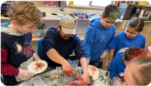
Coho in the Classroom 2022 - 2023

With pandemic restrictions easing, we had started up the educational program for the 2022-2023