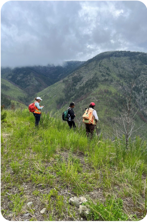
Arch crew discussing potential archaeological area of interest (AOI) the landscape below (Skoonka Creek, summer 2023)