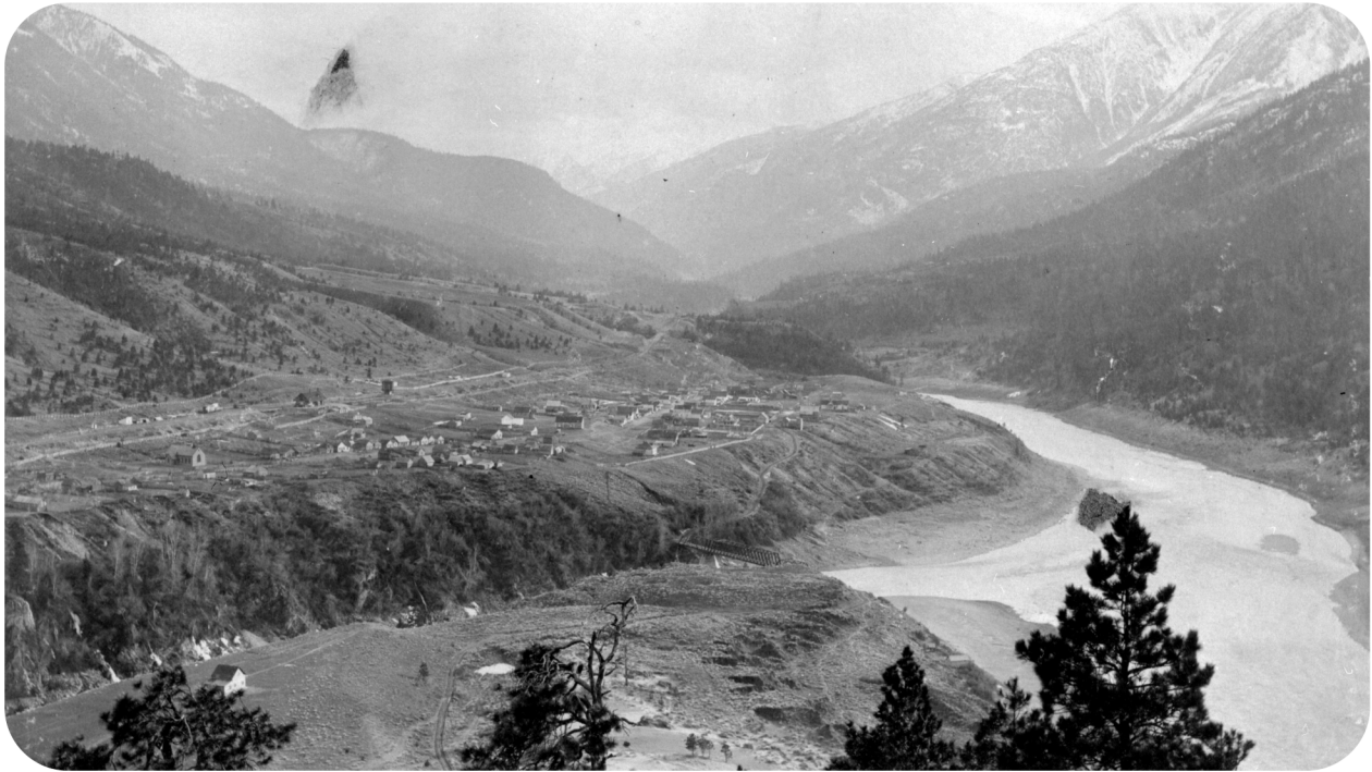
Lytton, BC approximately 1905