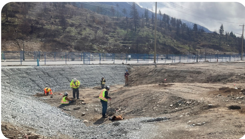
Village of Lytton - Crew shovel testing post remediation (Spring 2023)

We continue to conduct Heritage Field Reconnaissance (HFRs) in mining and forestry projects and provide that information on areas of interest (AOIs) and archaeological concerns to NNTC and our clients.