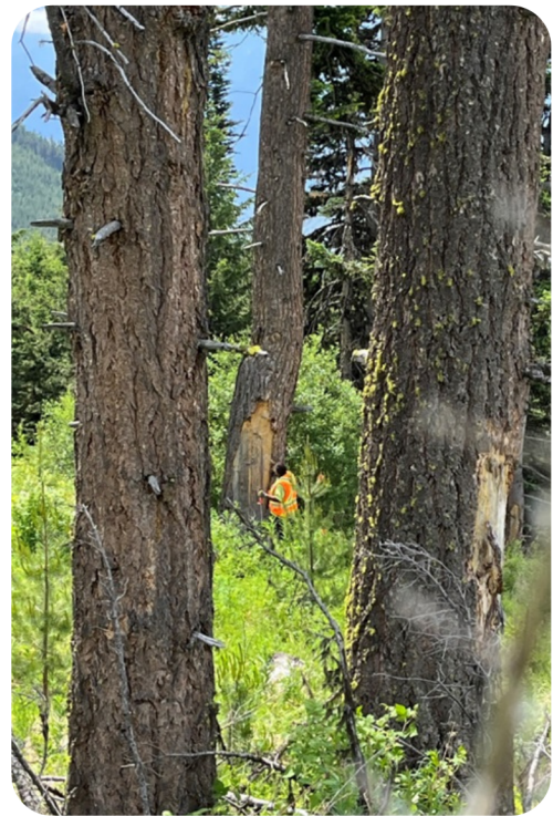
Eddy Peters examining a tree to verify if it is a CMT