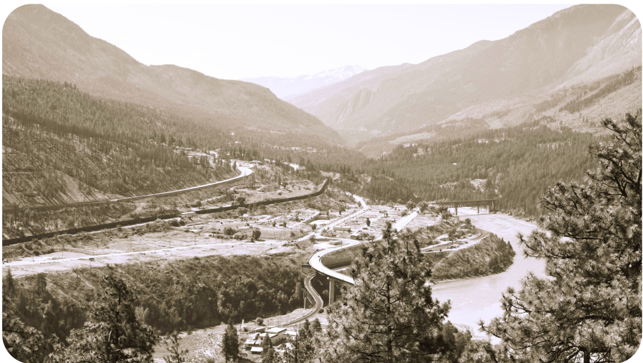
Lytton, BC June 2023