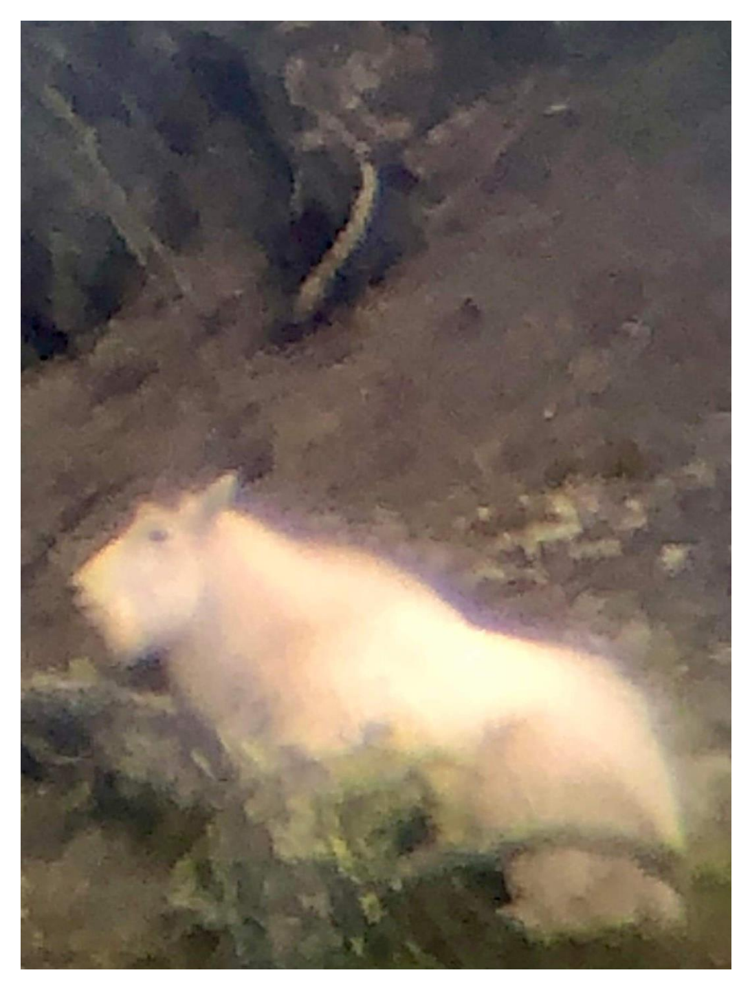
shwuheeeTLATS- Mountain goat above Ross Lake

Although present in the area, mule deer is by far the most abundant ungulate population. The watershed also hosts a wide variety of wildlife, cougars, black bears, bob cats, waterfowl, bald eagles, grouse, osprey, squirrels, chipmunks and much more. Various species of fish in the system as well.