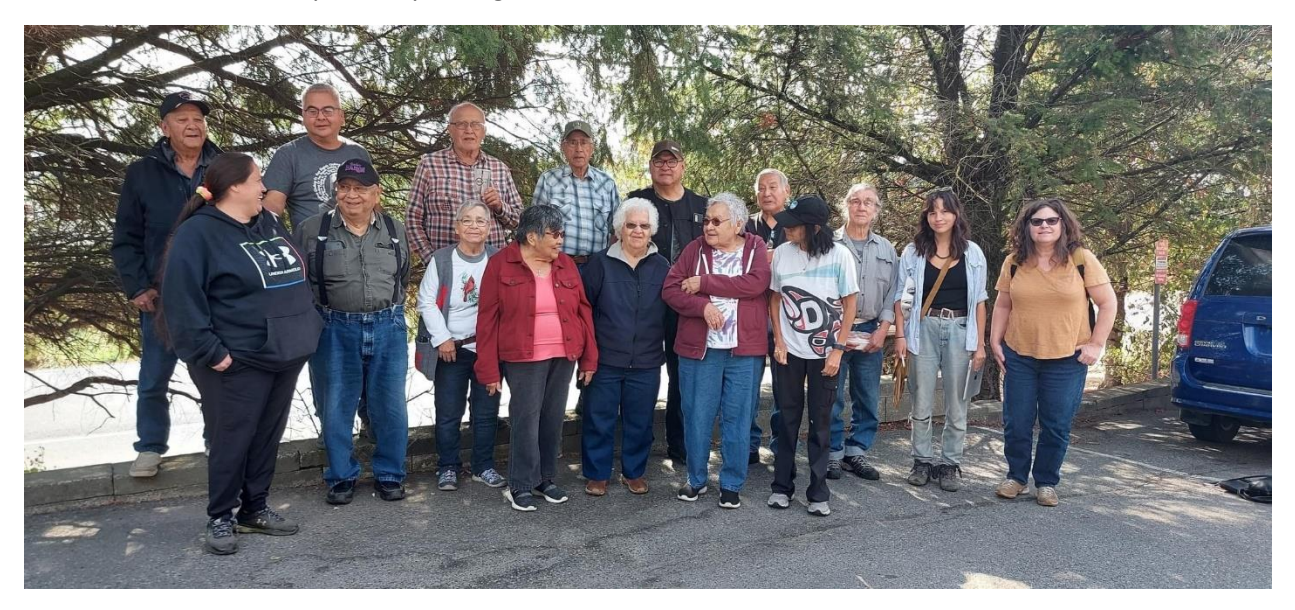
Nlaka'pamux Elder's , Tribal Council Staff- at New Halem, Washington

90% of the Elders Nlaka' pamux speaking.