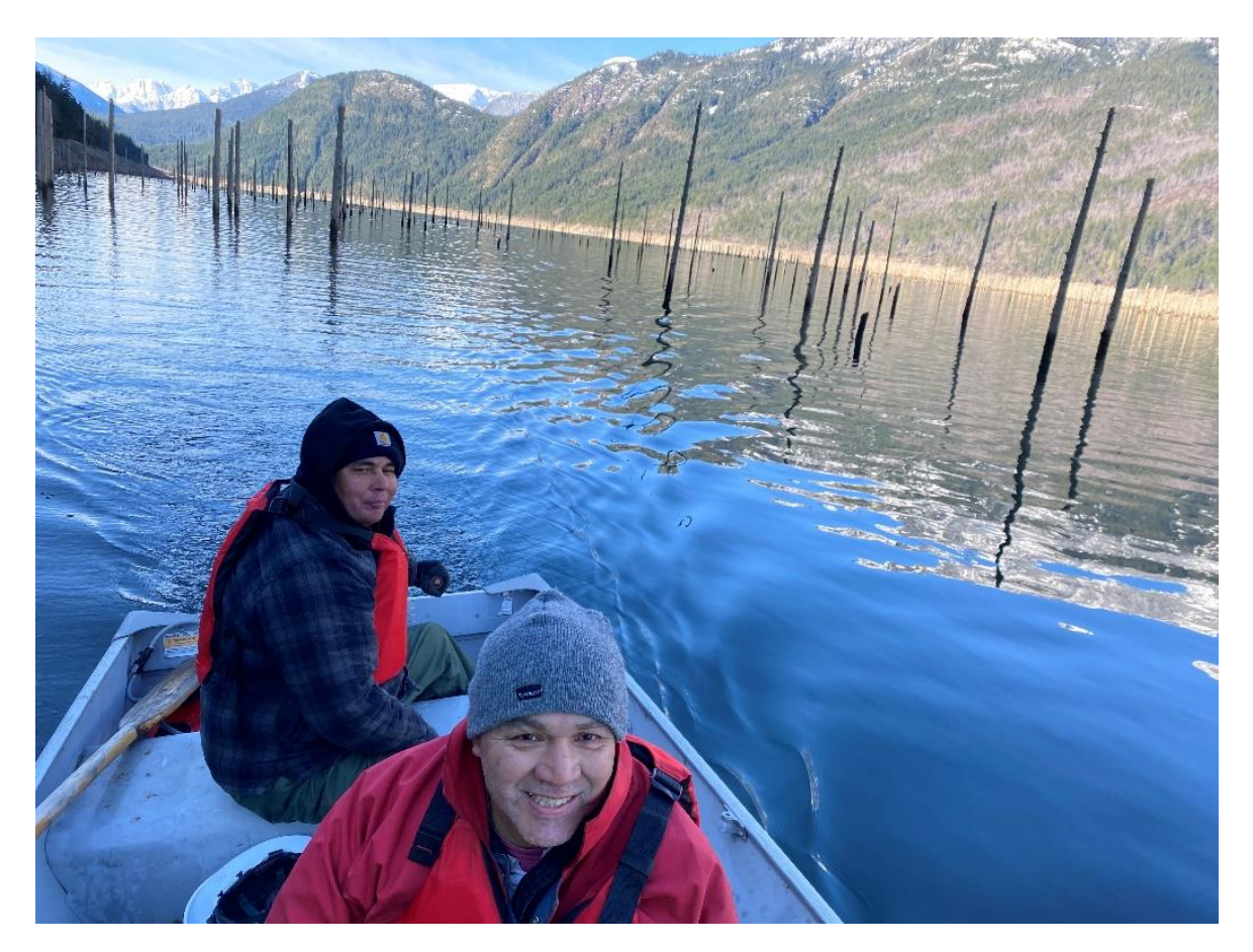
Ross Dam – Draw down 2022 headed north to lightning creek

First session of the trip, we experienced a variety of different weather patterns ranging from snow, sleet and occasional sunshine.