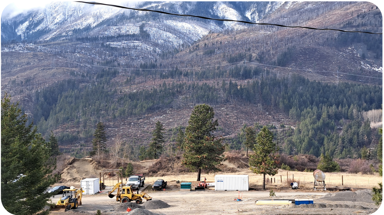
Pictured above is the new site of the Skuppah Food Security Centre.

Nlaka'pamux Nation Tribal Council (NNTC)'s quarterly news, announcements, and cultural and historical pieces